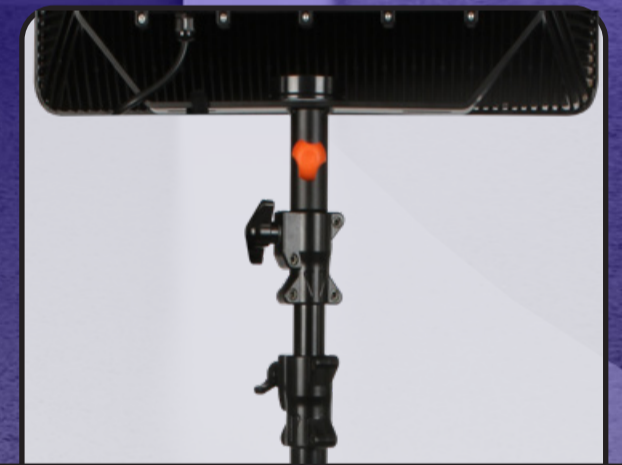
Height adjustable tripod.