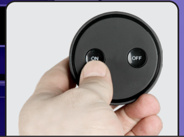
Possibility of remote control.